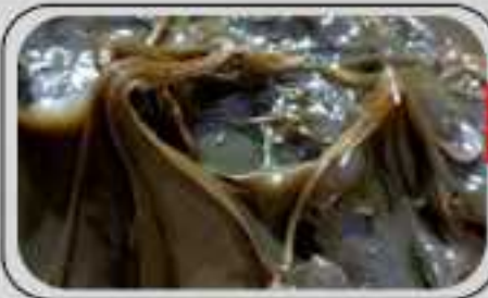
LR PREMIUM GREASE