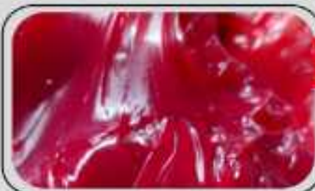
RED GEL GREASE