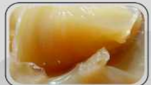
MP WHITE GREASE