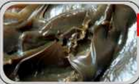
LR MEDIUM GREASE