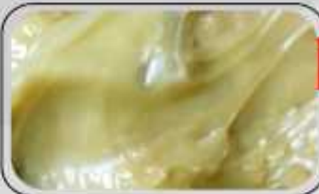
VP GOLDEN GREASE